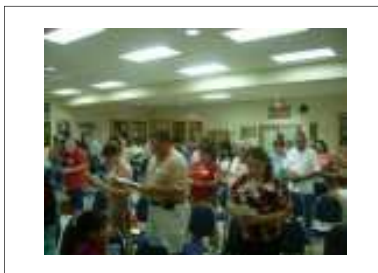
Participants at "An Evening of Compassion" watch documentary, hear immigrant stories, and lift their voice in prayer

The cards will be forwarded to the UMC's General Board of Church & Society which has been working for immigration reform.